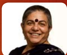
Dr. Vandana Shiva

Dr. Vandana Shiva is a philosopher, environmental activist, and eco feminist. She has fought for changes in the practice and paradigms of agriculture and food. Intellectual property rights, biodiversity, biotechnology, bioethics, genetic engineering are among the fields where Vandana has contributed intellectually and through activist campaigns. Navdanya created in 1991 is a national movement to protect the diversity and integrity of living resources, especially native seed, promotion of organic farming and fair trade. She is the founder of Navdanya.